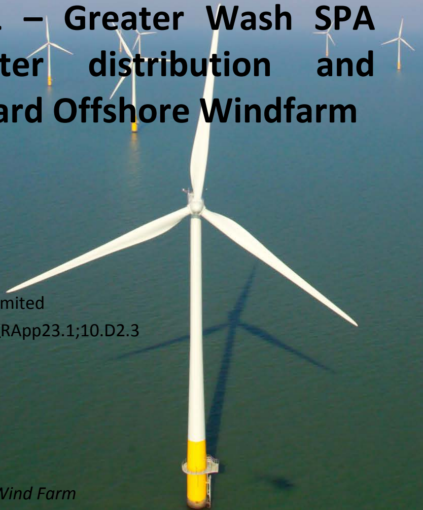
Photo: Kentish Flats Offshore Wind Farm